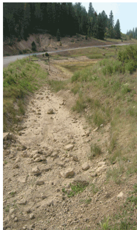
Swain's Creek Pond is dry!