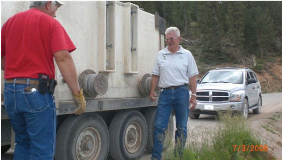
1300 pounds of trout arrived & were planted in a two week span just before July 4th.