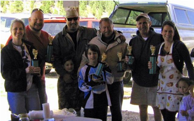
Memorial Day Chili Cook-off winners! This event raised over $800 to be used toward the playground project!!

Chairman, Swains Creek Pines Lot Owners Association