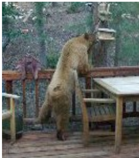
Bear sightings near Duck Creek and Color Country sub divisions.